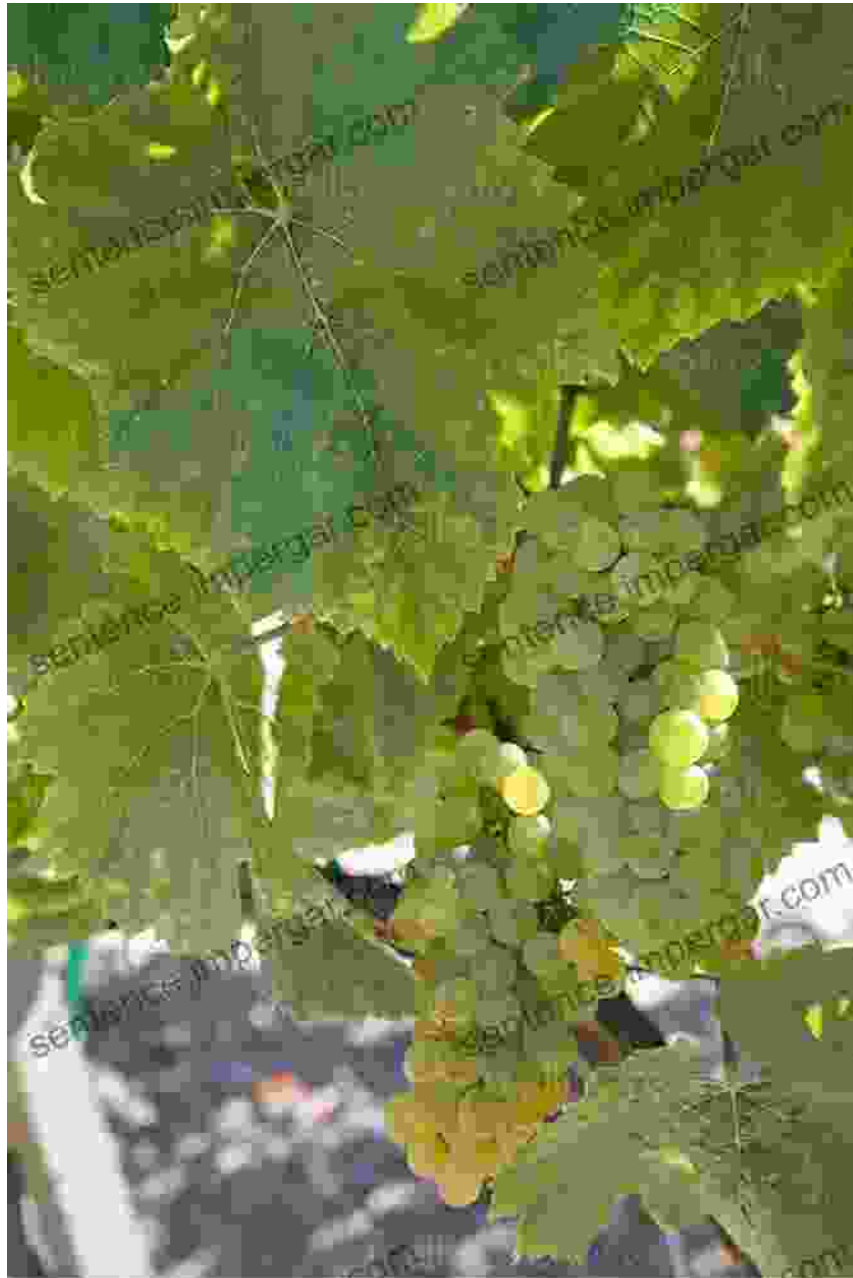
Chardonnay grapes, the backbone of many premium white wines.