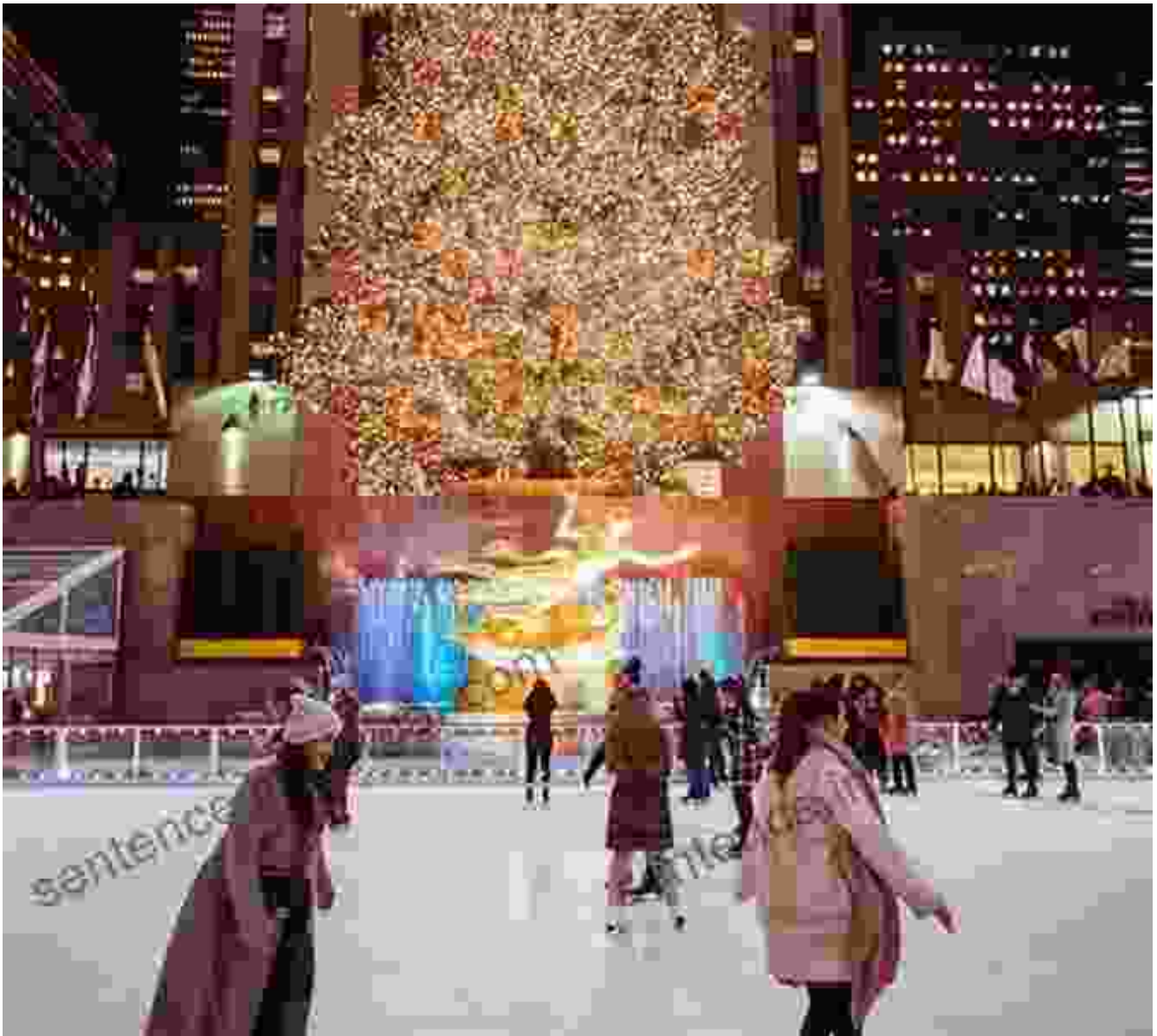
A Winter Wonderland: Exploring Rockefeller Center at Christmas

As the countdown to the lighting reaches its end, the crowd bursts into cheers as over 30,000 LED lights illuminate the tree, casting a warm glow over the surrounding area. The sight of the towering tree, adorned with over 8 miles of lights and topped with a dazzling star, is a breathtaking spectacle that leaves an enduring memory in the hearts of all who witness it.