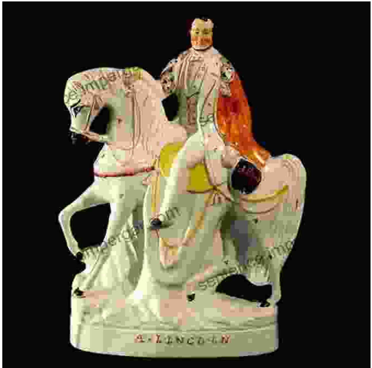
Staffordshire figure of Abraham Lincoln