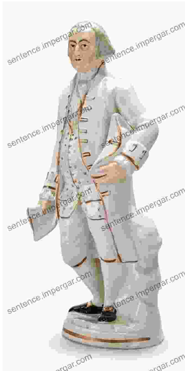
Staffordshire figure of George Washington