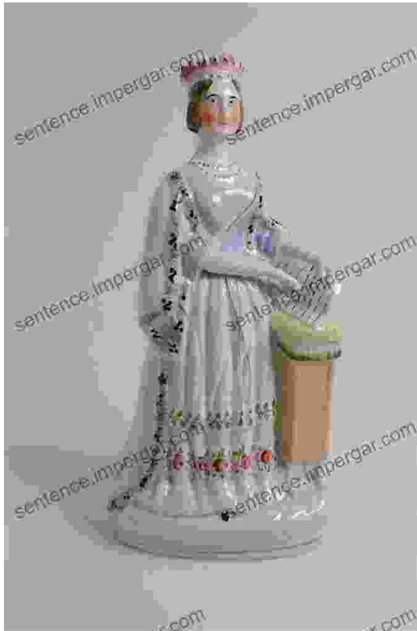
Staffordshire figure of Queen Victoria