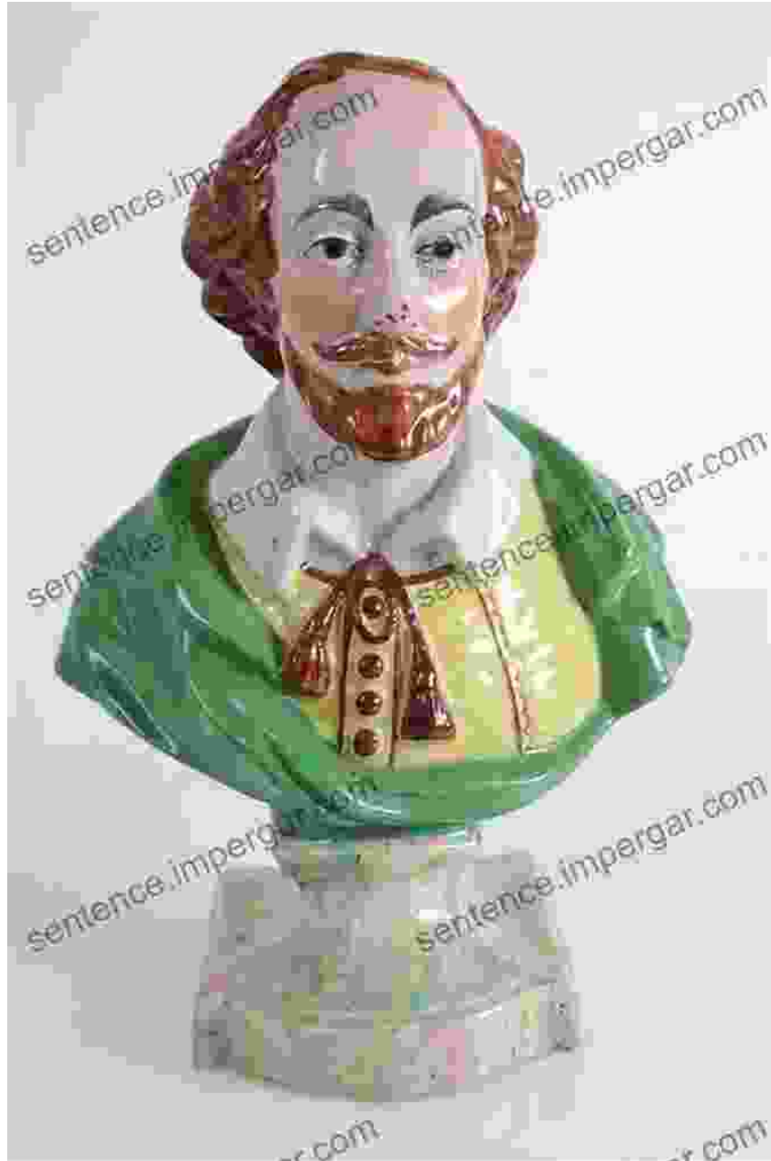
Staffordshire figure of William Shakespeare