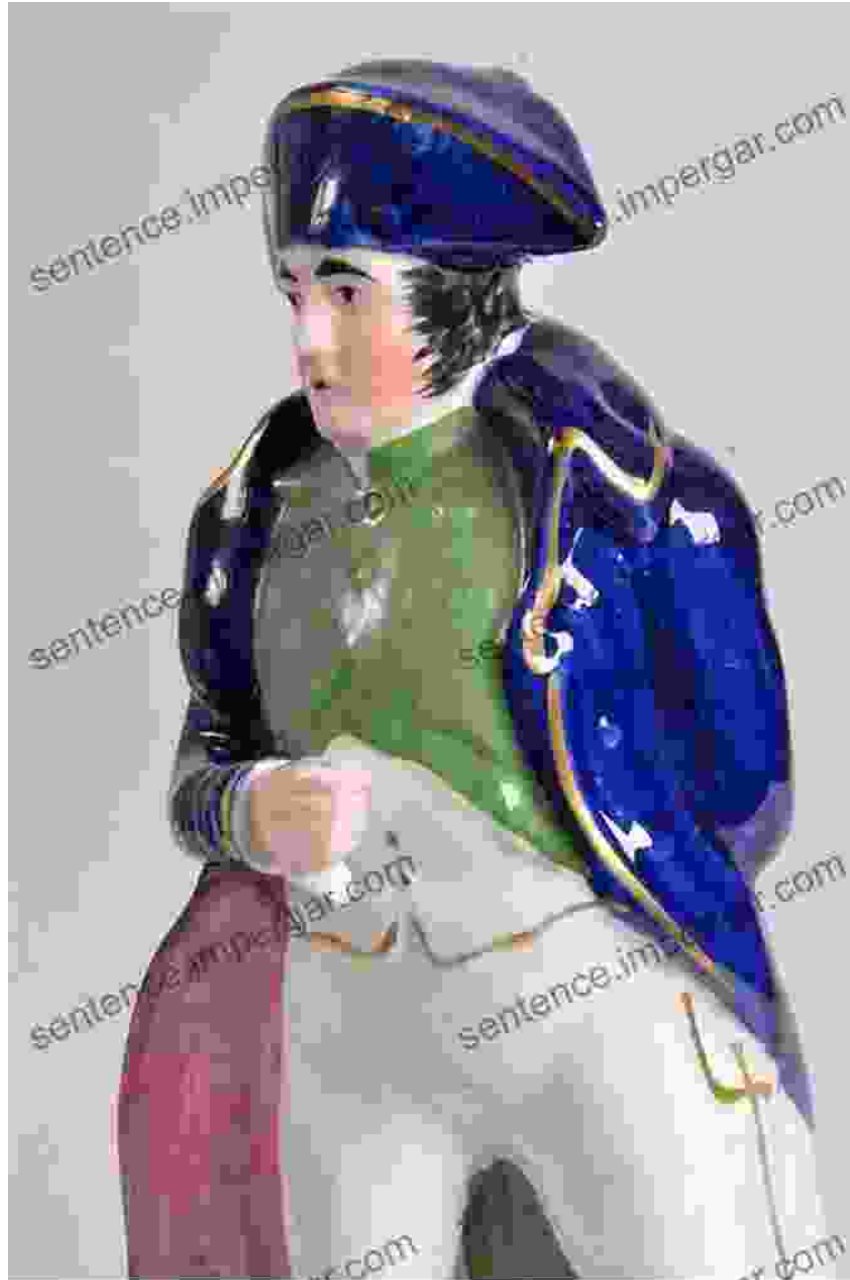
Staffordshire figure of Napoleon Bonaparte