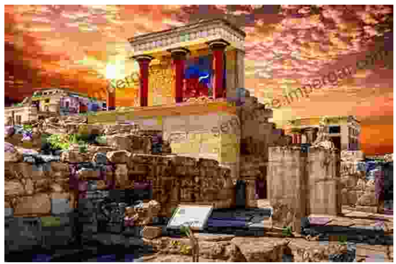
Exploring the Palace of Knossos and the Labyrinth of Crete

Journey to the heart of Minoan civilization at the Palace of Knossos, a magnificent architectural marvel that serves as a testament to the ingenuity and artistry of the Sea Kings. With Baikie as your guide, you'll wander through its labyrinthine corridors, marveling at the vibrant frescoes and intricate ceramics that adorn its walls.