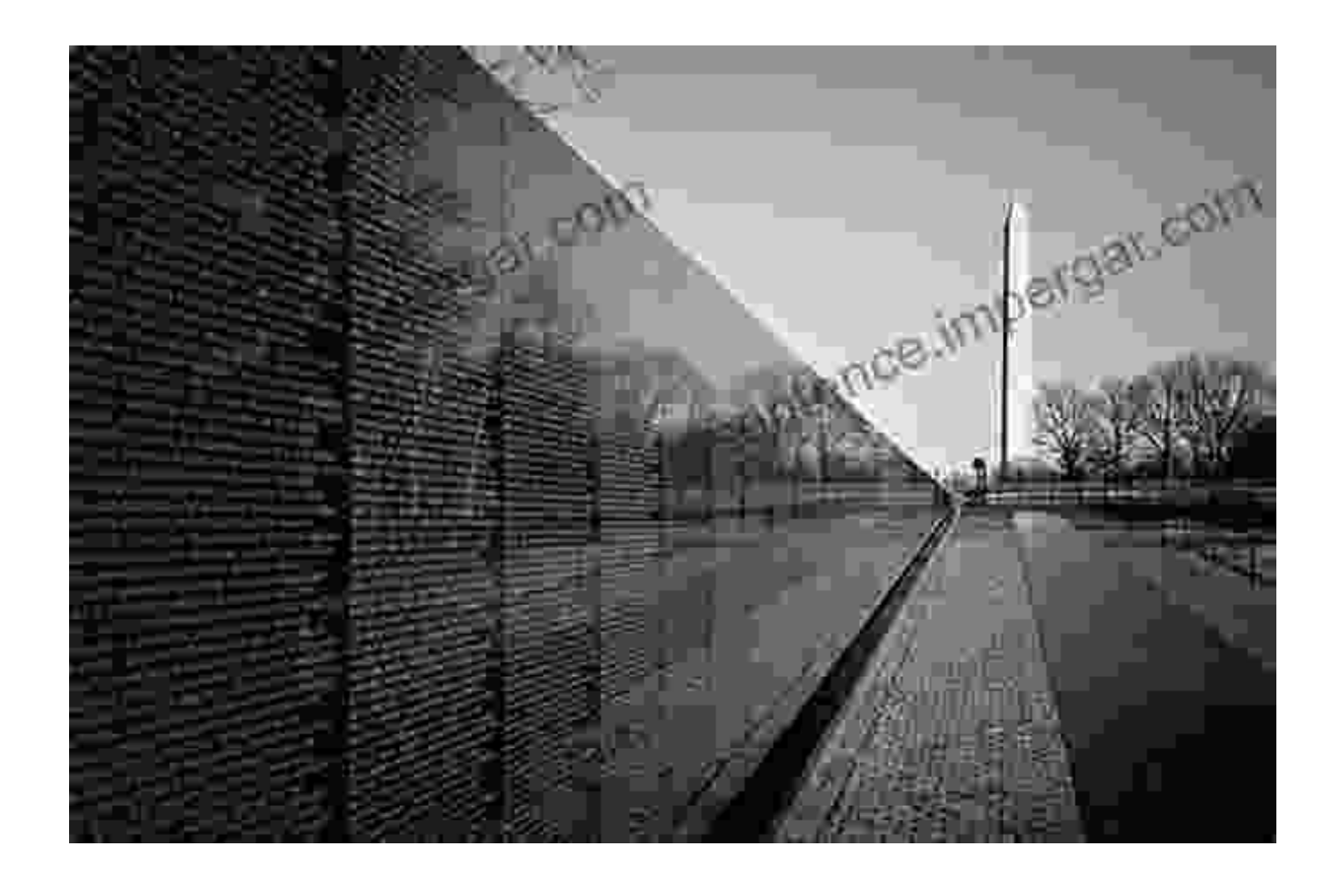
"Copse 125: Chronicle From The Trench Warfare Of 1918" is not merely a historical account; it is also a deeply moving tribute to the thousands of soldiers who lost their lives in that forgotten battle. The book honors their sacrifice and serves as a poignant reminder of the human cost of war.

By bringing the story of Copse 125 to a wider audience, the author hopes to ensure that these brave men are never forgotten. It is a powerful call to remembrance and a reminder of the importance of preserving the memory of those who fought for our freedom.