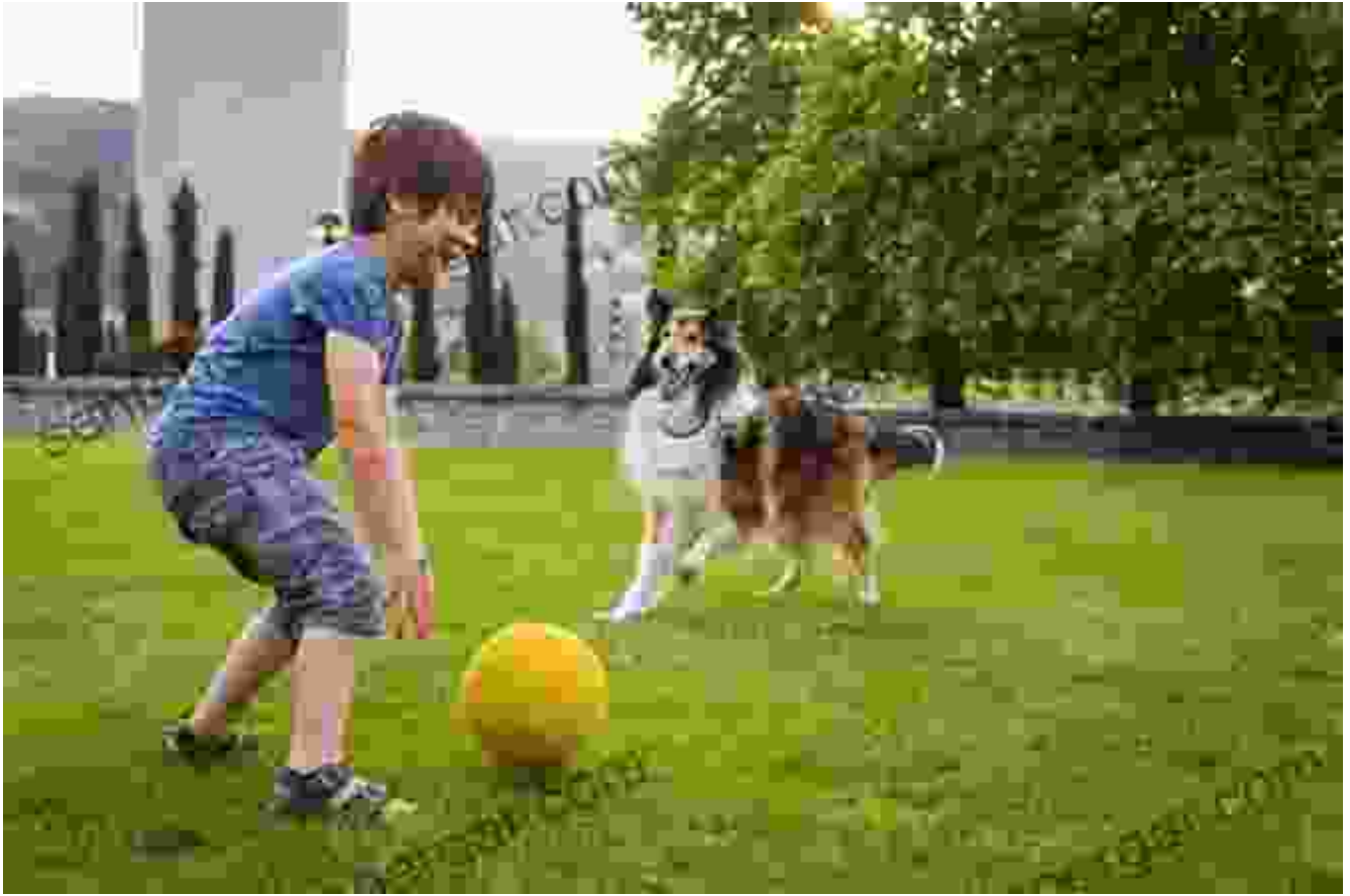
A heartwarming image capturing the special bond between a child and their pet