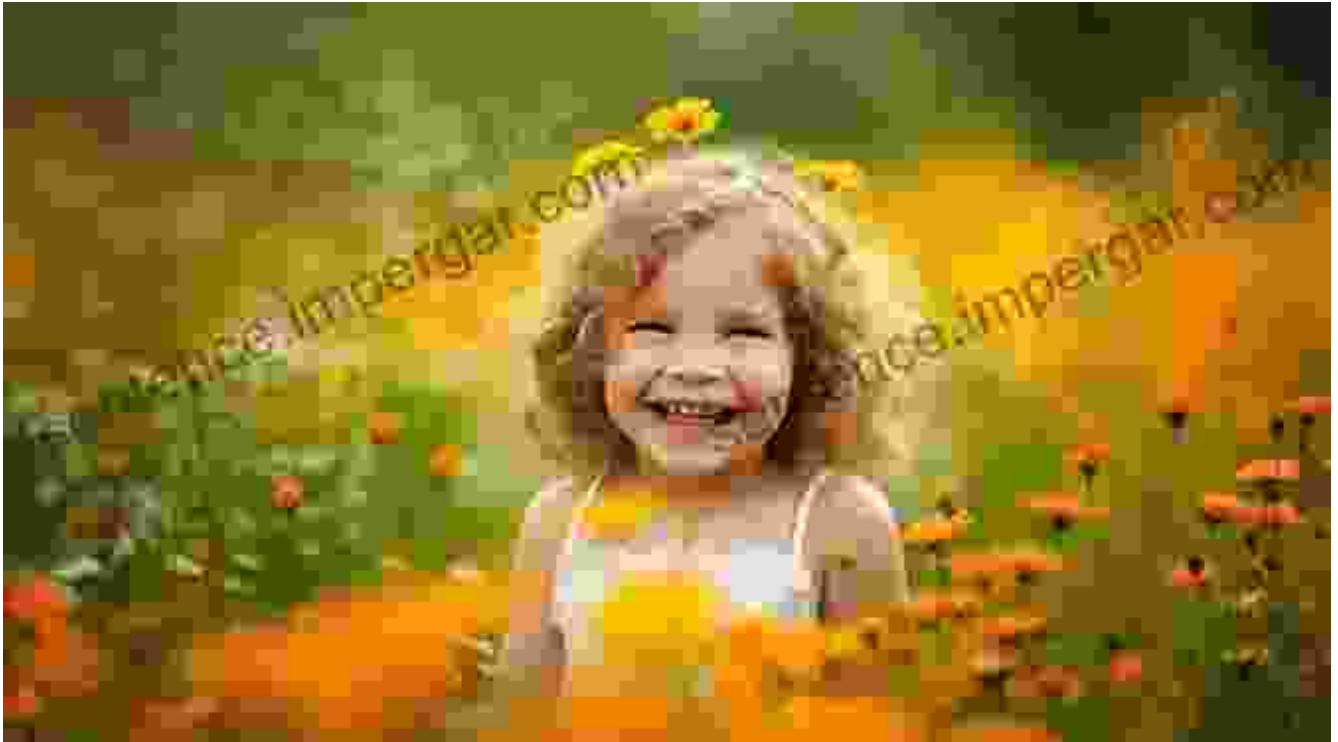
A candid capture of a child's pure joy